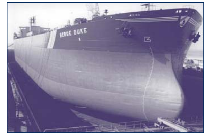
Used by over 50 ships in the Bergessen fleet.

The equipment is housed in its own robust metal case.